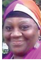
Aisha Muhammad Tauheed Center