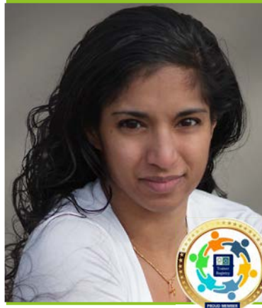
Ambi Daniel Center for Family & Recovery