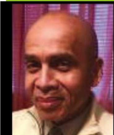
Jackson Davis Community Alternatives